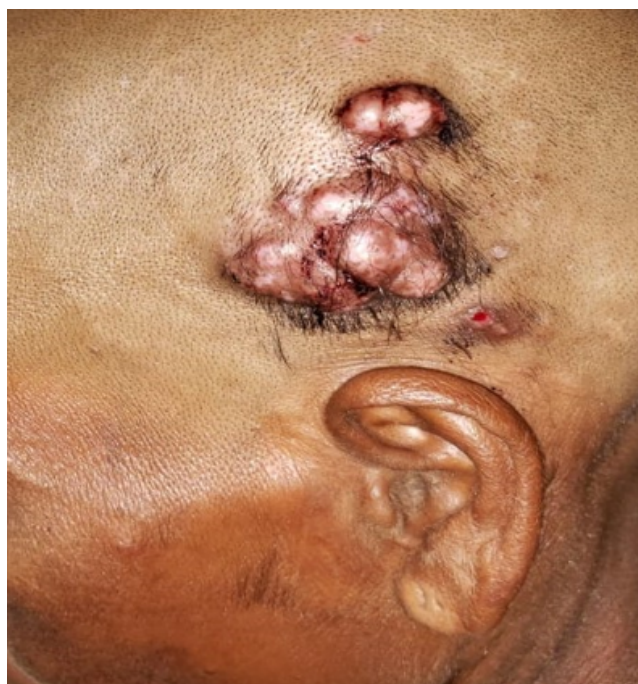
Fig. 1: Multiple nodular lesions in the temporal region of left sided scalp.