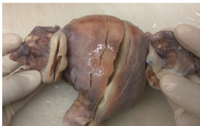
Fig. 1: Uterus, cervix with bilateral adenexa. Multiple calcified nodules were present in broad ligament on both sides.

diagnosis of osseous metaplasia with areas of calcification in hyalinized degenerated leiomyomas was given. Uterus, cervix with bilateral adenexa with multiple calcified nodules were present in broad ligament on both sides.