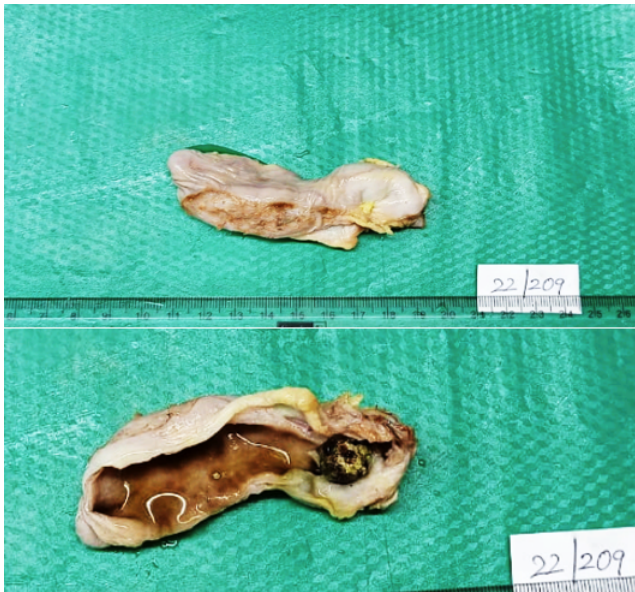
Fig. 2: External and cut surface of resected gall bladder specimen.

lymphocytes. No granuloma/malignancy seen in the sections studied.