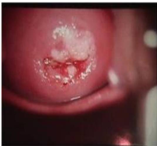
Fig. 1: Positive VIA test with Acetowhite area

After obtaining the Pap smear the cervix was painted with 3-5% freshly prepared acetic acid solution using sterile cotton swabs. The cervix was inspected after 1 minute and the results were noted as positive when there were distinct “acetowhite” areas and as negative when no “acetowhite” areas were seen.