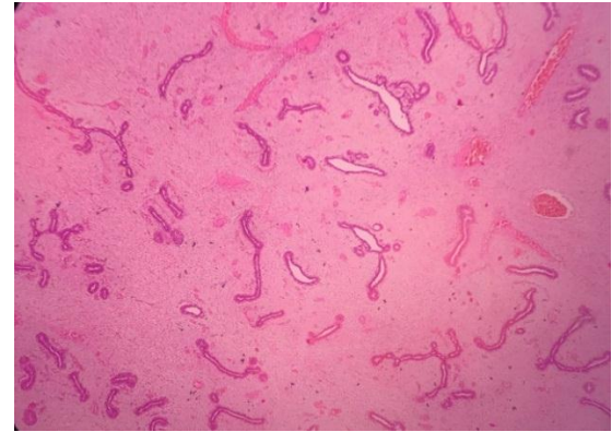
Fig. 2: Photomicrogaph showing predominantly intracanalicular pattern of fibroadenoma. (H&E x 100)