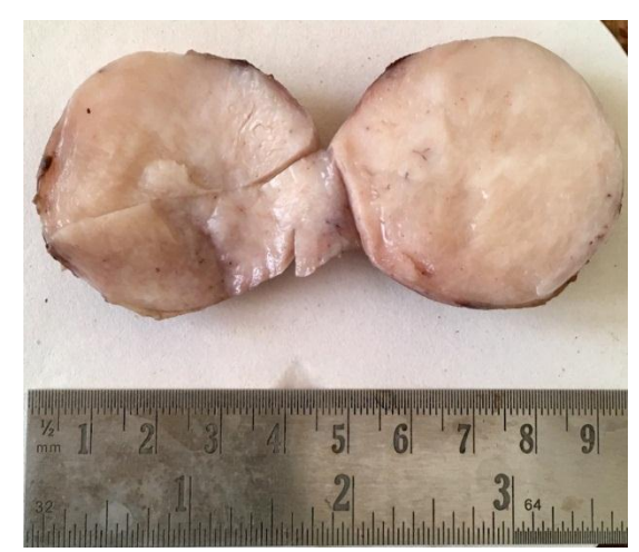
Fig. 1: Gross appearance showing a partially encapsulated grey white to grey brown tumor. Cut surface is homogenous with slit like areas

myoepithelial layer. Histopathological features were compatible with fibroadenoma.