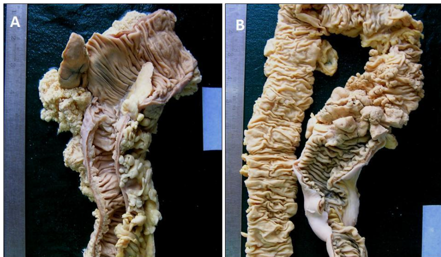
Fig. 1 A): Gross picture: lipomatous polyp of colon; B): Gross picture of Familial adenomatous polyposis with multiple variably sized polyps in colon

with Synaptophysin and dot like positivity with panCK. So it was diagnosed as neuroendocrine tumour. In another case, 120 adenomatous polyps were identified in colon. It was diagnosed as Familial Adenomatous Polyposis (FAP) (Fig. 1).