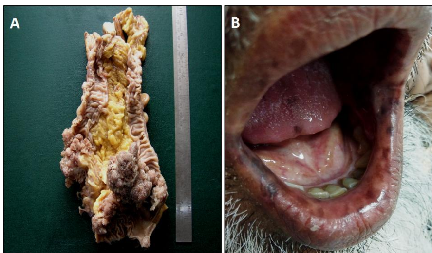
Fig. 2 A): Gross picture: Peutz Jeghers syndrome with multiple polyps in colon and with adenocarcinomatous transformation; B): Mucocutaneous pigmentation in PJ Syndrome of the same case

lips and oral cavity that were not identified by the surgeon initially (Fig. 2, 3). Hence it was diagnosed as PJS and the patient is on follow up. Hence we emphasize the need for complete clinical details of patients along with the specimens.