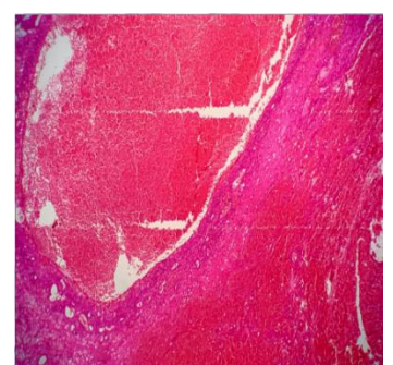
Fig. 5: Microscopically shows a cyst composed of luteinized granulosa cells and filled with hemorrhage

Fig. 4: Microscopically shows outer layer of theca interna cells and variable inner layer of granulosa cells