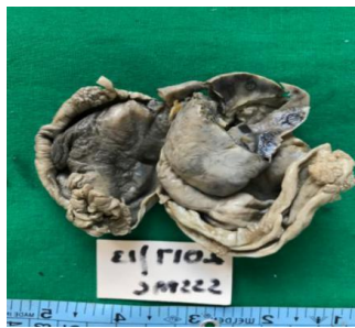
Fig.3: Shows cut-section of ovary with papillary projections on the outer surface and protruding into the cystic cavity. Other area shows brownish to blackish in colour

Fig. 2: Shows cut-section of ovary with cystic corpus luteum measuring 1x 0.8cm and many follicular cyst each measuring 0.5x0.3cm