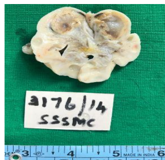
Fig. 2: Shows cut-section of ovary with cystic corpus luteum measuring 1x 0.8cm and many follicular cyst each measuring 0.5x0.3cm