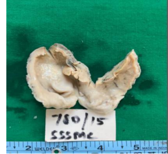
Fig. 1: Shows cut-section of ovary with unilocular thick walled cyst, light yellowish in colour and glistening surface