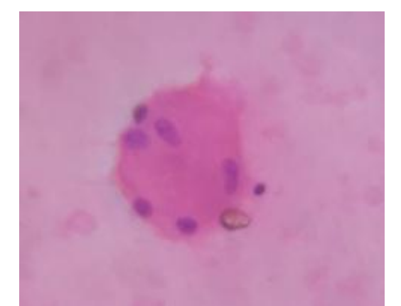
Fig. 3: Langhan's type of giant cell