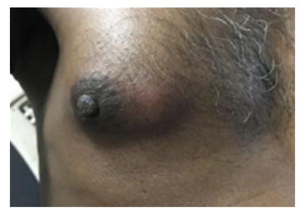
Fig. 1: Swelling in the right breast

Haliyal taluk, Karwar district was informed to start anti tuberculous treatment under RNTCP Programme.He is responding to treatment and currently followed up.