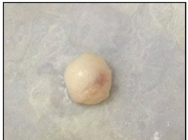
Fig. 1: Gross image of the encapsulated circumscribed resected mass

calcification was noted. There was no mitosis or atypia. The tumor was positive for vimentin and SMA. A diagnosis of fibrous pseudotumor was rendered. The patient was asymptomatic at 1 month of follow-up.