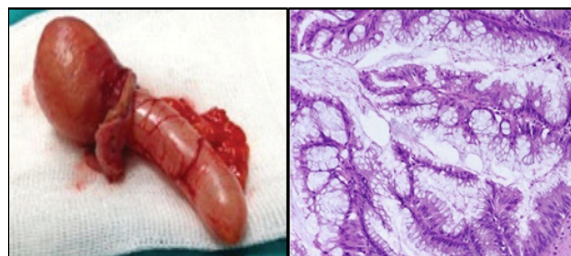
Fig. 1: Mucinous adenoma (A) Dilated appendix with dilated lumen obliterated by mucinous material (B) Appendiceal mucosa is lined by papillary folds composed of benign columnar cells with stratification and abundant mucin (H&E 200x)