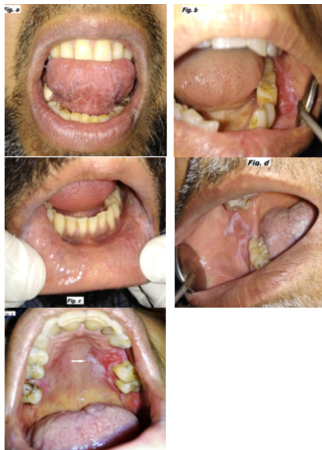
Fig. 1: 1a-e

It is the most unusual clinical form, characterized by formation of blisters that gradually increases in size and tend to rupture, leaving the surface painful and ulcerated surrounded by fine radiating striae of reticular type . Nikolsky's sign may be positive. (Figure 1e)