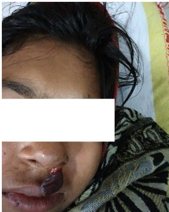
Fig. 1: Clinical photograph of patient showing a reddish polypoidal mass projecting from left nasal cavity.

GCTs are seen frequently arising in the head and neck regions; they are found most often on the tongue, but also occur on the skin and in the stomach, bronchi, and bile ducts. Within the head and neck regions, GCTs have been found in the larynx, soft palate, labial mucosa, uvula, oral floor, gingivae, orbits, lacrimal sacs, nasolacrimal ducts, and parotid glands. (Table 1). 5,6 It is difficult to differentiate GCT in nasal cavity from Congenital epulis, Granular cell ameloblastoma and rhabdomyoma clinically.