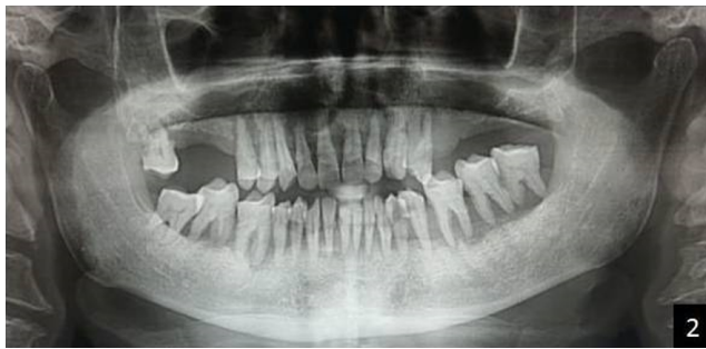
Fig. 2: Orthopantomogram revealed presence of generalized bone loss