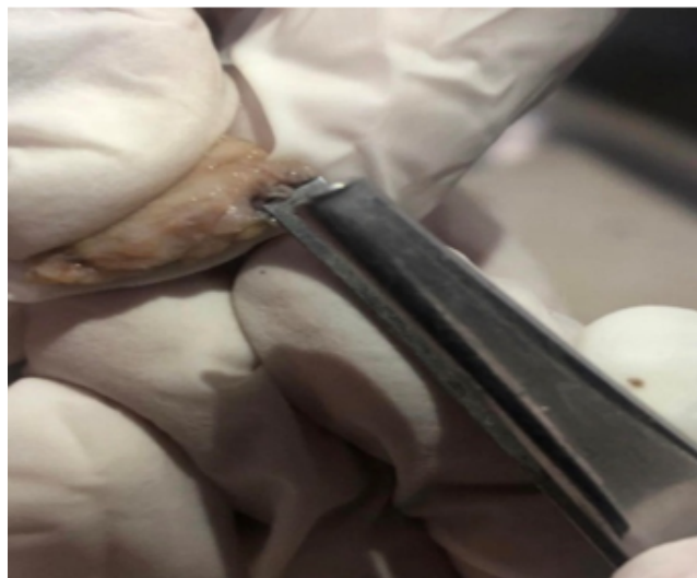
Fig. 1: Gross image of the filiform worm in the excised specimen.