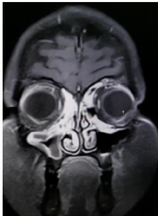
Fig. 1: MRI with contrast gadolinium showing hyper dense lesion in ethmoid & sphenoid sinuses with orbital extension.

Also correlated with the microbiology department where nasal crusting and nasal tissue was obtained for fungal elements for KOH wet mount and fungal culture. KOH wet mount microscopy revealed Broad aseptate hyphae with wide angle branching suggestive of Mucormycosis. Simultaneous analytical study of CBP showed raised total WBC counts in 4 individuals (19,620-24,670 cumm) with others having normal CBC.CRP was in the range of 32-68mg/dl with ESR 35-98 mm/hr.