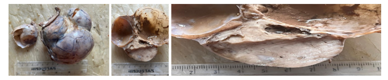
Fig. 1: Gross finding