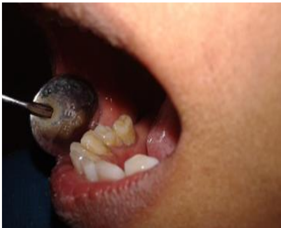
Fig. 2: Lingual aspect of 45 showing recession with heavy calculus deposit.