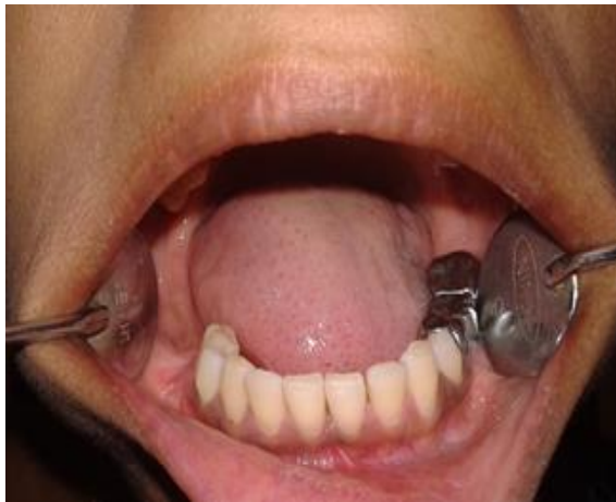
Fig. 1: Intraoral photograph showing Macrodontic 45 2 nd premolar.