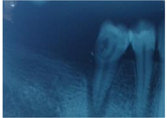
Fig. 3: IOPA showing Deep invagination noted at the coronal portion dividing it into two halves.

aspect of 45 showed recession with heavily deposited calculus (Fig 2). Then patient subjected for intraoral radiography, which shows a deep invagination noted on the coronal aspect (Fig 3). As patient was not willing to save the tooth and it was grade 2 mobile we performed extraction of the tooth and sent for ground sectioning. The ground section showed a clear deep invagination at the coronal surface (Fig 4) and the photomicrograph shows irregular dark calcified material surrounded by altered dentinal tubules in dentin. The dentinal tubules have lost "s" shaped structure and dead tract is evident surrounding the calcified material. Enamel appears to the normal showing enamel tufts and lamellae (Fig 5). As the tooth was grade 2 mobile and patient was not willing for saving the tooth we performed extraction with the same.