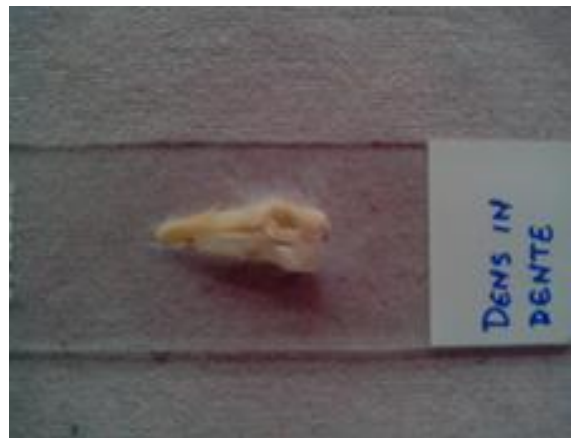
Fig. 4: Ground section showing the invagination at the coronal portion.