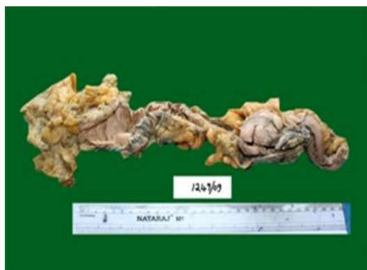
Fig. 1: Gross specimen of resected large intestine with exophytic growth

KRAS mutation detection by PCR-SSCP: For each case, the H and E slide was examined and representative area was circled. The corresponding area on the 20-micron section slide was then scraped into a labelled 1.5 ml sterile micro tube using a sterile scalpel blade.